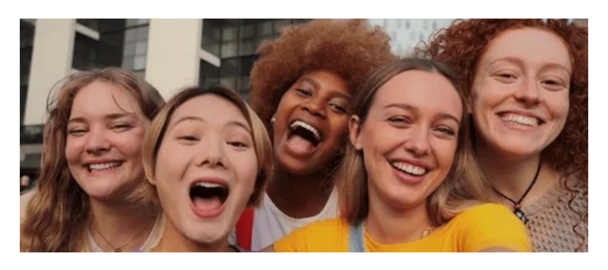
Club Giving & Founders Pennies