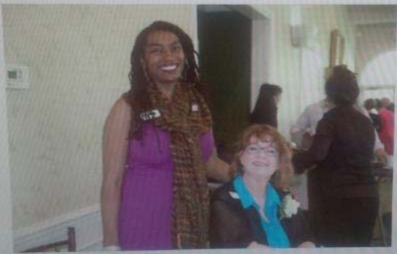
Manassas Soroptimists offering $2.5K grant to help women continue their education

BREAKING -> KPWB hosts "Farmers Fair" fundraiser in Haymarket, Apr. 28 -> Prince William County Bar Association 1:57:50